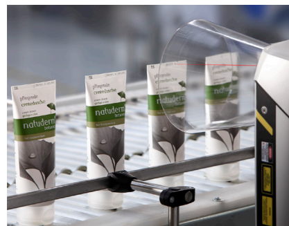
SE Standard Environment IP31 C-60W / C-80W / C-100W