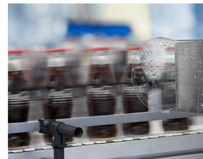
WD Washdown IP65 C-60W / C-80W / C-100W / C-80p / C-125p